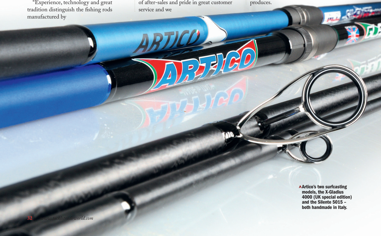
▲ Artico's two surfcasting models, the X-Gladius 4000 (UK special edition) and the Silente 5015 – both handmade in Italy.

An example of the dedication and fine-tuned specification that Artico applies to its rods can be seen in one of its additions to the 2014 range, the X-Gladius 4000 Special UK Edition surfcasting rod. As the name suggests, the rod has been built specifically for the rigours of UK surfcasting – a kind of detailed specification and customisation that Artico can apply to almost any rod it produces.